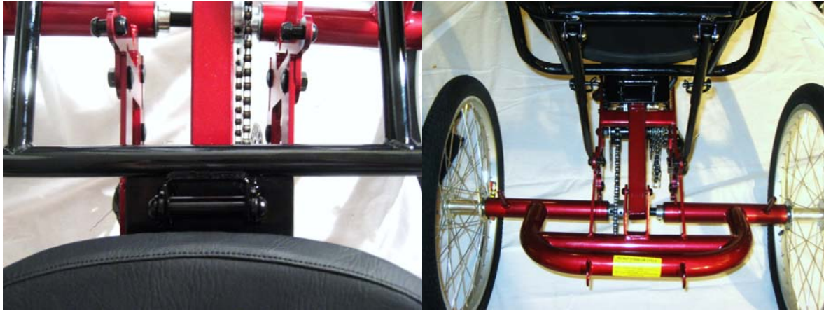
Center support for back rest

Attach main frame to the center bracket using Allen wrenches. Attach the adjustable braces to the rear bracket on the main frame and also to the back rest frame. Tighten bolts while ensuring that the frame can slide while the saddle seat is slid back and forth.