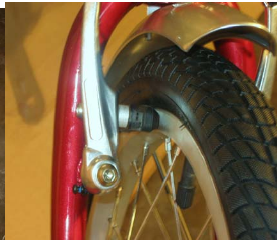
Front Brake shoe aligned