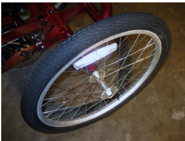
Rear wheel with locknut

Remove nylon locknut from rear axle and slide rear wheels onto the shaft aligning the key square with the slot on the hub.