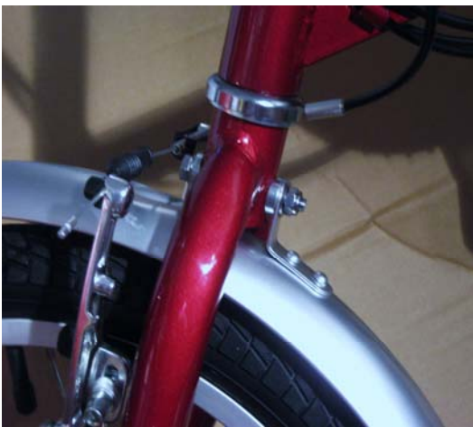
Front fender bracket

Attach the front fender to the front fork with the bracket on the back of the fork and the brace attached to the fork at the threaded hole. It may be necessary to loosen the brake shoes and then align them to the rim for proper contact.