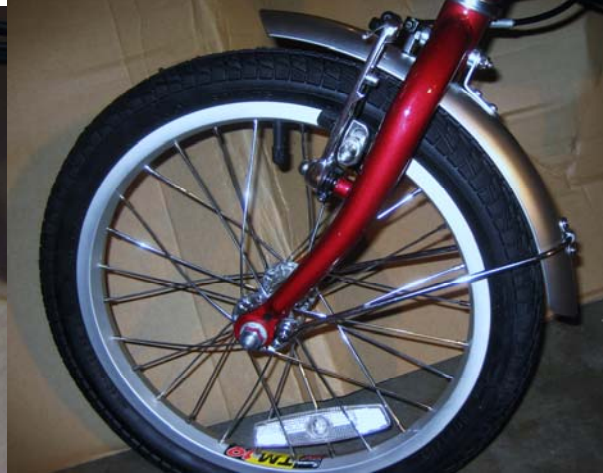
Front wheel with fender

Remove nylon locknut from rear axle and slide rear wheels onto the shaft aligning the key square with the slot on the hub.